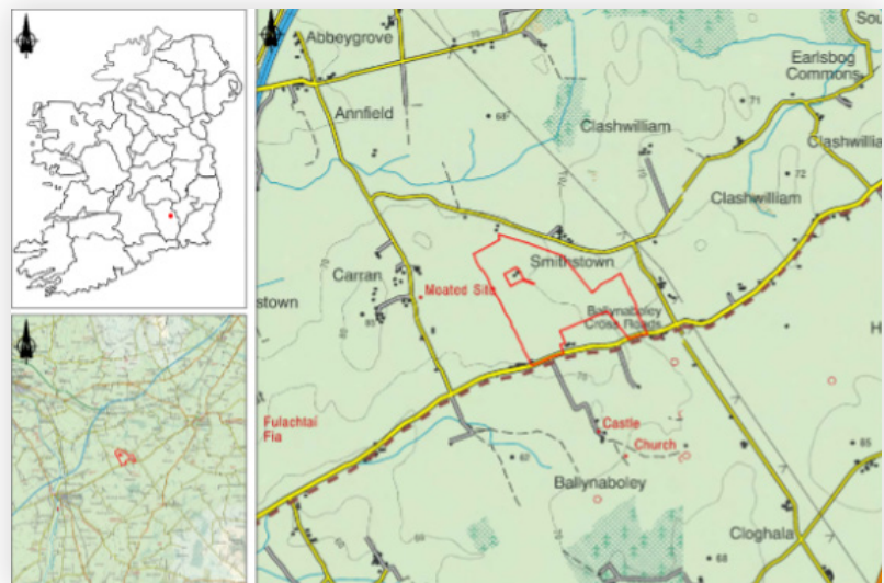
Figure 1 - Site location map of Clashwilliam Solar Farm.

Clashwilliam Solar Farm will connect to the electricity grid at Kilkenny 110kV (kilovolts) substation. A 5.7km (kilometres) underground cable will connect the Solar Farm to the 110kV substation. Construction of the Solar Farm will involve the installation of ground mounted solar panels on light steel frames and the installation of associated underground cabling.